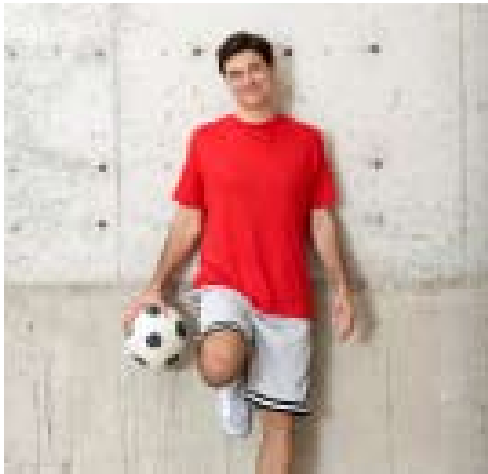
Dr. Mehmet Oz

What does renowned heart surgeon Mehmet Oz do to keep his own heart strong? His answers and the reasons behind them may surprise you—And inspire you to do the same.